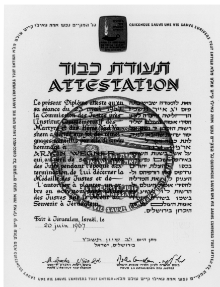
Wegner was awarded the title of “Righteous Gentile” by the Yad Vashem in Israel, 1968.

Righteousness was always the jewel in the crown of the nations, and Herr Reichskanzler, it is not just a matter of the fate of our Jewish brethren, the fate of Germany is also at stake! As a German born and bred, I appeal to you to put a stop to all this. I have both the right and the duty to appeal to you, for my heart is seething with indignation, and I was not endowed with the gift of speech merely to make myself an accomplice by remaining silent. The Jews have survived captivity in Babylon, slavery in Egypt, the Inquisition in Spain, the oppression of the crusades and sixteen hundred pogroms in Russia. The resilience that has enabled this people to survive to the present day will also enable them to overcome this threat. But the opprobrium and ignominy which now adhere to Germany as a result of this will not be forgotten for a long time!