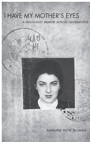
I Have My Mother's Eyes Ronsdale Press, 2009