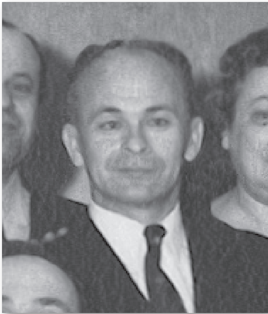
Shmerke Kaczerginski, 1953

I went to a beys medresh (house of prayer) not long ago, and I was overwhelmed with fear when the entire congregation stood to wail kaddish (memorial prayer) at the end. I had the nagging thought that the dead are lucky, really; at least they have someone to say kaddish for them for the time being. Who will say kaddish for us? or remember us?