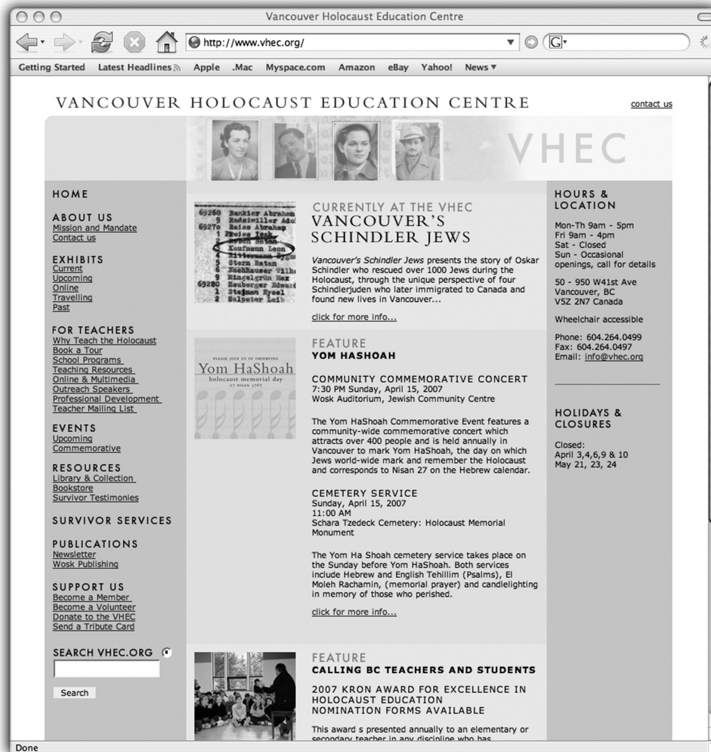
The VHEC homepage

The Vancouver Holocaust Education Centre (VHEC) is proud to announce the launch of its new website, which visitors including members, students, teachers and the wider public can find at www.vhec.org . People often form their first impressions of an organization from its website. Website visitors develop immediate and strong opinions about the work of an organization based on the site's aesthetic appeal, the clarity of its content and the ease of its navigation.