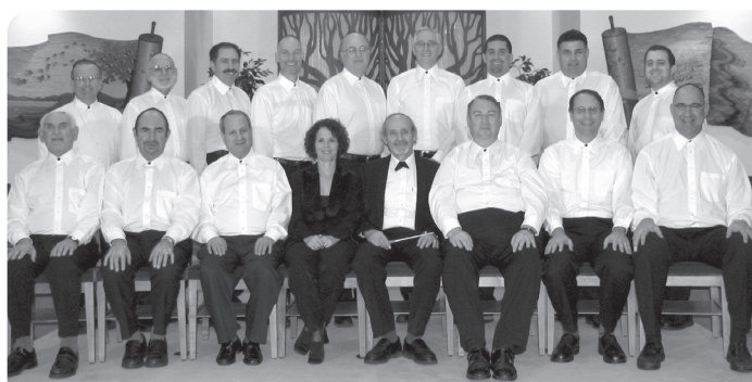
Above: The Vancouver Jewish Men's Choir

Sponsors: The Gail Feldman Heller Endowment Fund and the Sarah Rozenberg-Warm Memorial Endowment Fund of the Vancouver Holocaust Education Centre, Jewish Community Centre of Greater Vancouver, Jewish Federation of Greater Vancouver & The Jewish Community Foundation, with financial assistance from the Province of British Columbia