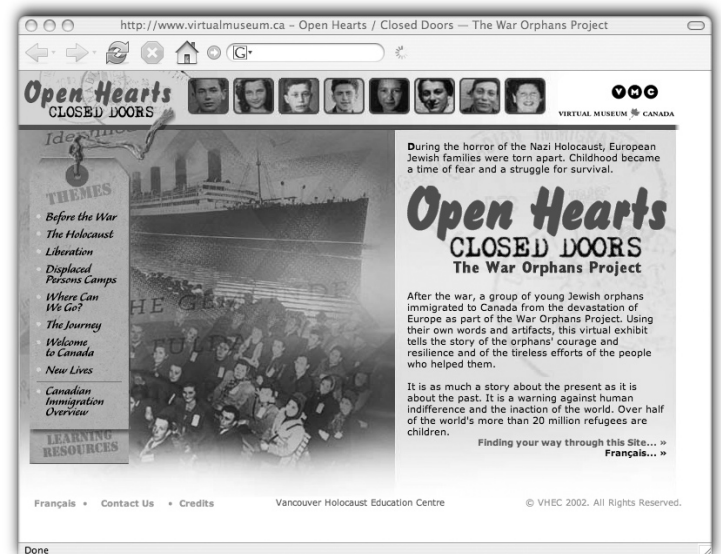
The online exhibit Open Hearts - Closed Doors is one of our multimedia tools linked through the VHEC website