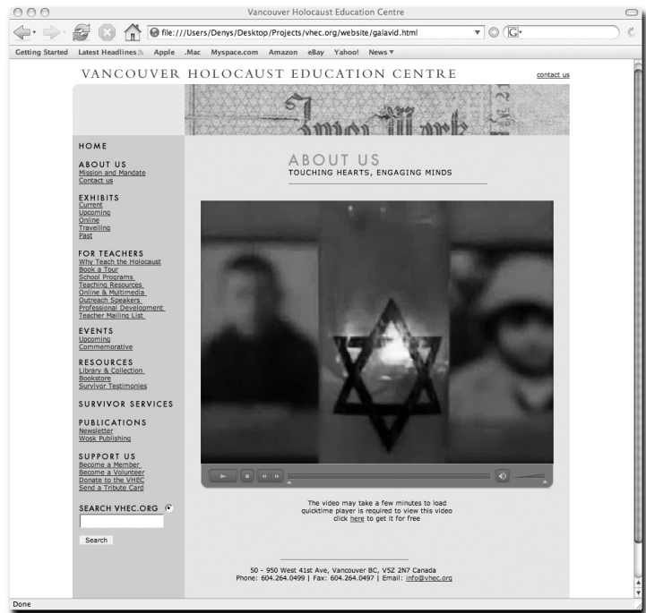
The video Touching Hearts - Engaging Minds plays inside of a web browser

Since it was launched for testing there has been an average of ninety-four visitors a day to the VHEC site, many of these visitors are from outside of Canada. The development of a new website opens doors to producing more extensive and dynamic online exhibits, encourages interest and discussion and educates not only those in the lower mainland but anywhere around the world.