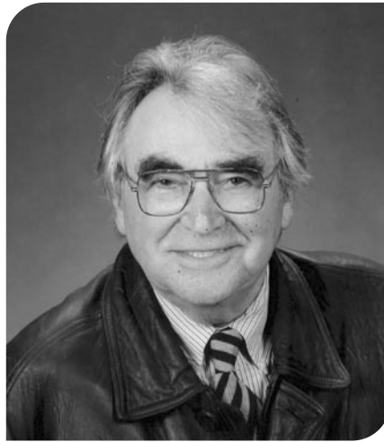
Professor Rudolph Vrba

While it is imperative that we recognize the courage and bravery of the non-Jews who stepped forward at great personal risk, we must not forget that there were also Jewish rescuers. Thousands of Belgian Jewish children and Dutch Jewish children were rescued by Jews and placed in hiding. The proportion of Jews in various resistance movements far exceeded their actual numbers and they were in double jeopardy.