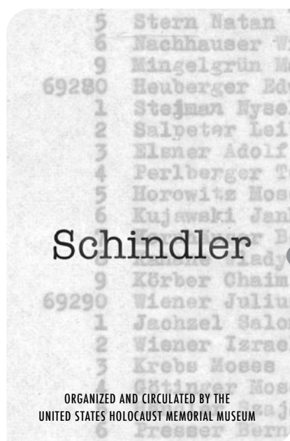
EXHIBIT OPENING AND RECEPTION PLEASE JOIN US