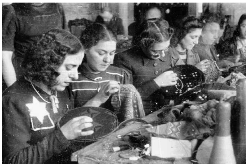
Women working in the Lodz ghetto.

The Vancouver Holocaust Education Centre, in partnership with the German Consulate General in Vancouver, is proud to present the West Coast launch of a new teaching exhibit, The Face of the Ghetto: Pictures Taken by Jewish Photographers in the Litzmannstadt Ghetto, 1940-1944 .