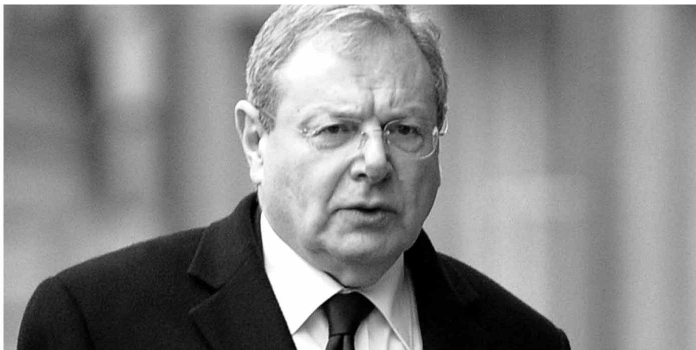
Sir Martin Gilbert

Wonderful tributes from around the world poured out following the recent passing of Sir Martin Gilbert, Churchill's official biographer and renowned Holocaust historian.