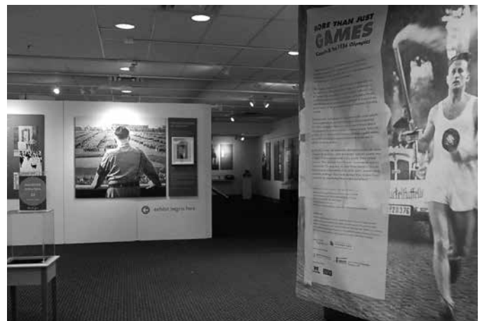
More Than Just Games exhibit at the VHEC, September 2009 to June 2010.