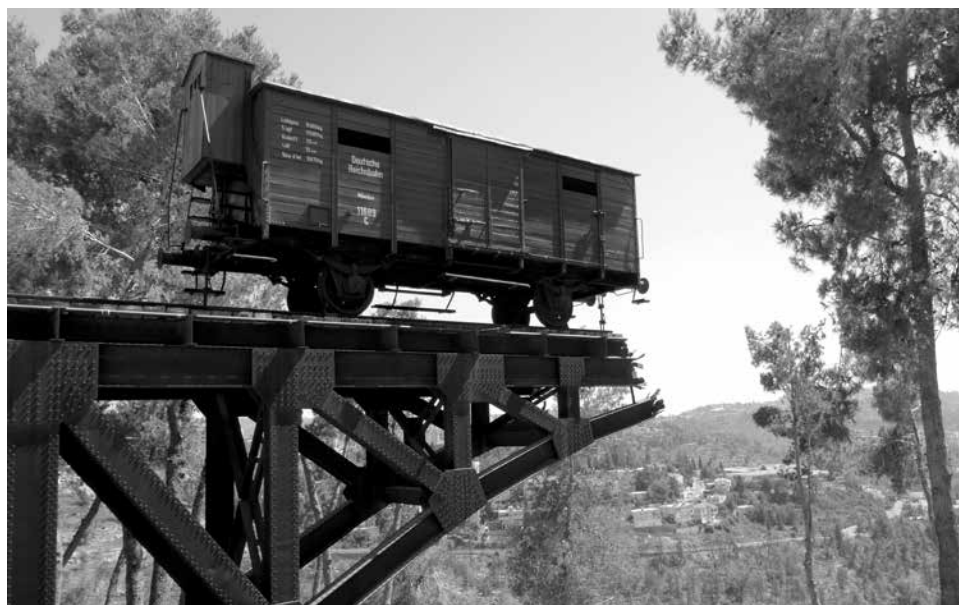
Box Car at Yad Vashem.

In Israel we were exposed to some of the world's most foremost scholars and thinkers on the topic. On the surface some of the lectures were heavy with religious and historical content and had us wondering how we could incorporate all of this information