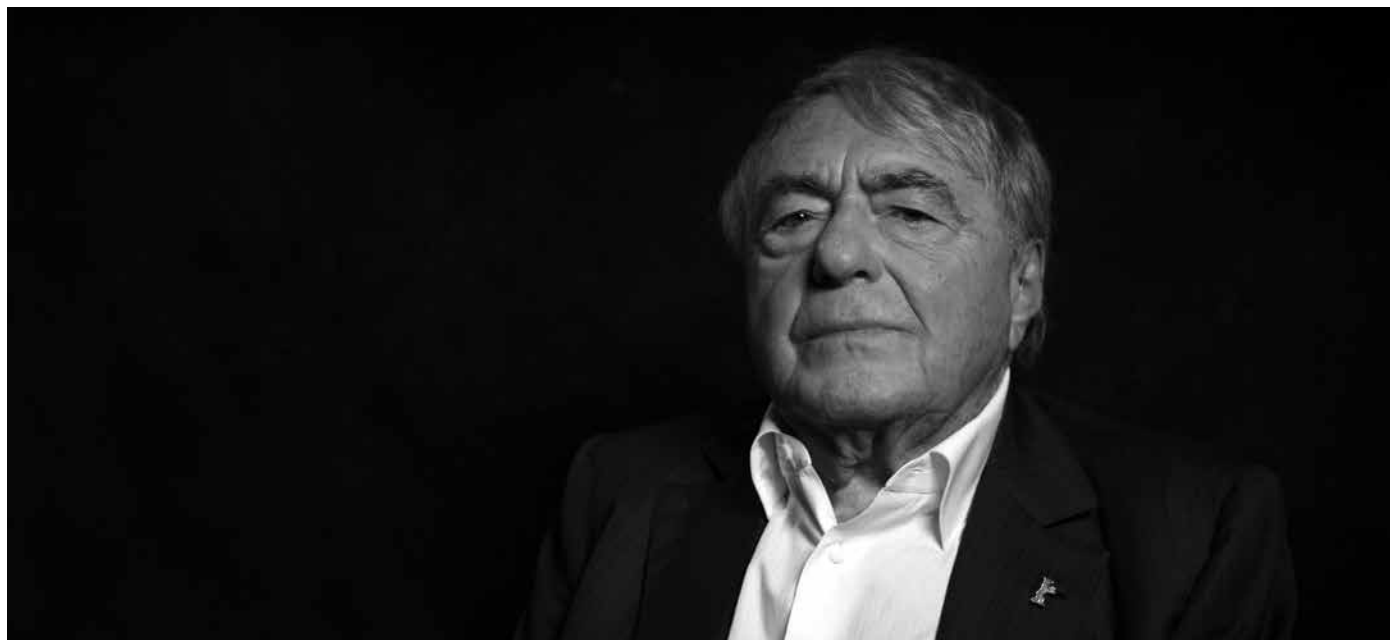
Claude Lanzmann: Spectres of the Shoah .

Even if Claude Lanzmann's Shoah were not nine and a half hours long, did not take twelve years to make, and was not culled from over 225 hours of 16mm film footage, it would remain an extraordinary motion picture. As a Holocaust "documentary" (a term the filmmaker rejects), it is especially remarkable: it has no voice-over, there is no musical score, and, apart from three occasions where still photographs are captured by the camera, there is no archive footage — no traditional sequences of pre-war Jewish life, antisemitic riots, roundups, ghettos, camps, liberation. It is not that kind of film. Its unusual start — two minutes of silent and slowly scrolling introductory text — foreshadows the slowness of the journey on which the audience is about to embark. There will be no racing through this film.