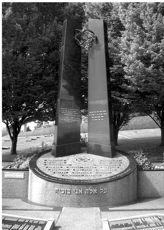
VHEC Holocaust Memorial at Schara Tzedek Cemetery, New Westminster.