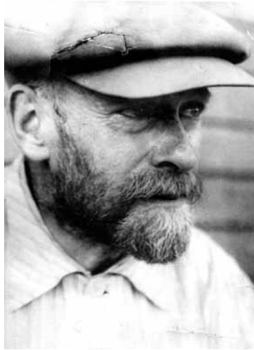
Janusz Korczak — The Ghetto Fighters' Museum (Israel)

Janusz Korczak Day at UBC is co-organized by the Janusz Korczak Association of Canada and the Faculty of Education at UBC. It is sponsored by the Consulate of the Republic of Poland in Vancouver and the Vancouver Holocaust Education Centre.