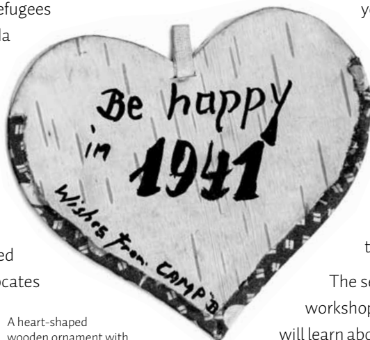
A heart-shaped wooden ornament with best wishes for a happy year, Camp B (Ripples, New Brunswick), circa 1941.

We appreciate hearing from our visitors, and look forward to welcoming more informed, aware students back in the future.