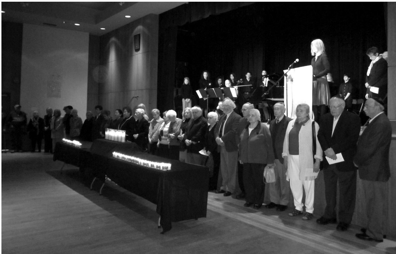
Candle Lighting; Yom HaShoah Commemorative Evening