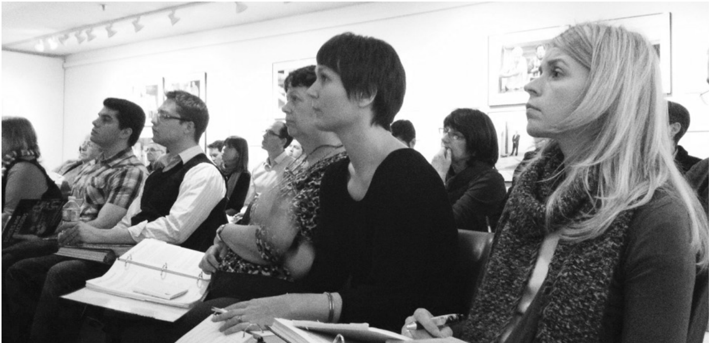
VHEC 7th Biennial Shafran Teachers' Conference

The VHEC hosted 60 educators from B.C. and Washington State at the 7th Biennial Shafran Teachers' Conference. VHEC docents were also present at the event.