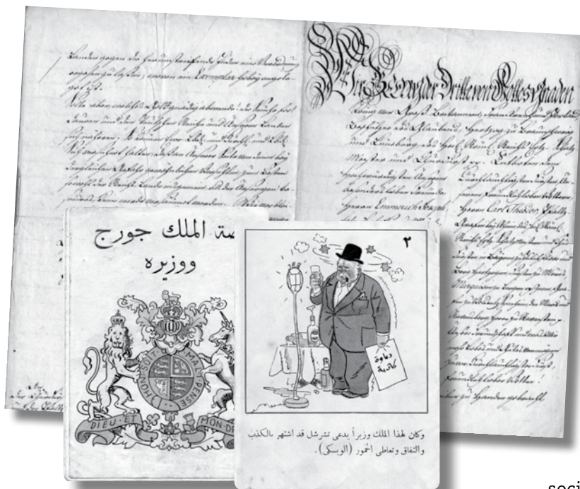
TOP: King George III edict. BOTTOM: Anti-British propaganda pamphlet.