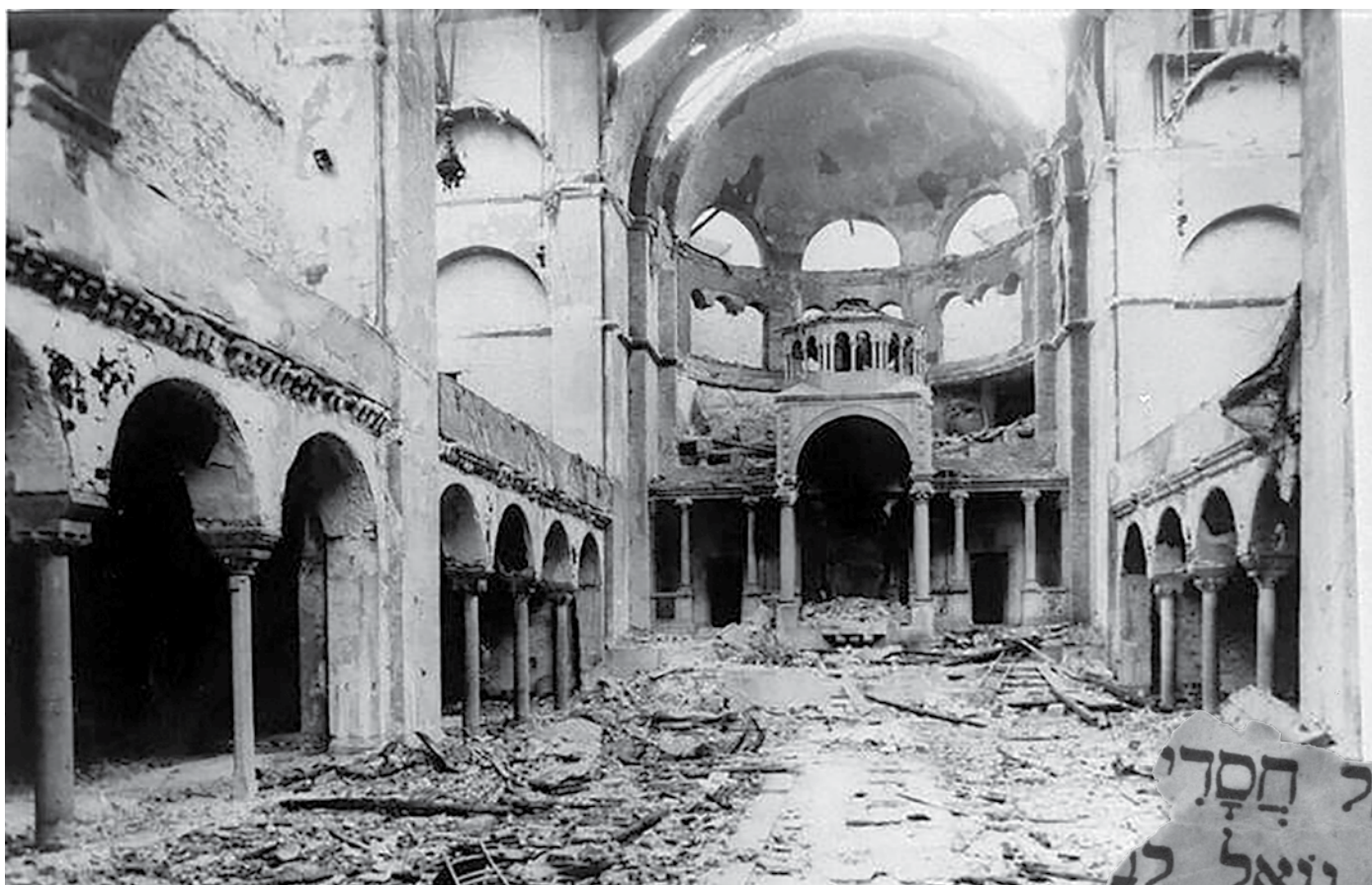
TOP: Interior view of the destroyed Fasanenstrasse Synagogue, Berlin; burned on Kristallnacht. RIGHT: Fragment of a prayer book burned during Kristallnacht. Berlin, Germany.