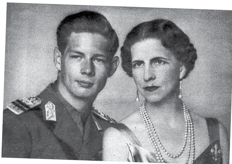
King Michael and Queen Mother Elena of Romania.

It had never occurred to me that one day I would be able to personally thank the Sovereign for what he did five decades ago. And yet the occasion arose in 1992. I will remember this meeting as long as I live.