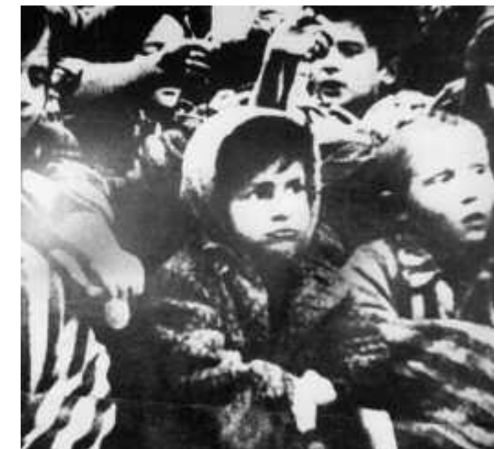
Child survivors of Auschwitz on the day of liberation, January 27, 1945

From its founding in 1940 until 1945, the Nazis deported a total of 1.3 million people to the Auschwitz II – Birkenau camp complex, over a million Jews, 150,000 Poles, 23,000 Roma, 15,000 Soviet POWs, and over 10,000 prisoners of other nationalities. The overwhelming majority of them died in the camp, which became, above all, the site of the mass extermination of Polish and European Jews. Auschwitz III constituted a network of sub-camps. Of the nearly 1,300,000 people the Nazis imprisoned there over 1,100,000 people perished.