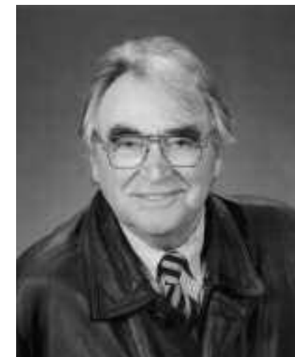
◀ Dr. Rudolf Vrba, Auschwitz Survivor